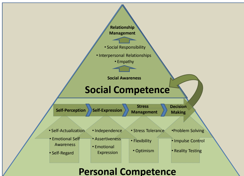
Fig. 1. The Model of EI for physician leaders that serves as the basis for UNC's Leadership Development Institutes

EI skills can be over-used as well as under-used —especially when not used in balance. When under-used the effects are often dramatic and easy to observe. Although over-use can manifest more subtly, the results can be equally problematic to the individual and the organization, though perhaps harder to identify or “diagnose”. Several examples of both effective use of EI skills and potential EI “mis-steps” are presented below.